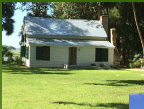
Garvin House Bluffton