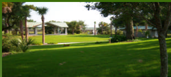
City of Folly Beach Folly River Park