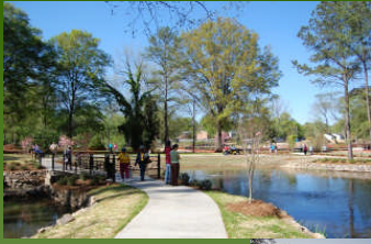
Glencairn Garden Rock Hill