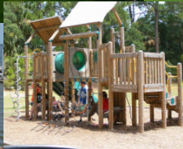
Hunting Island State Park